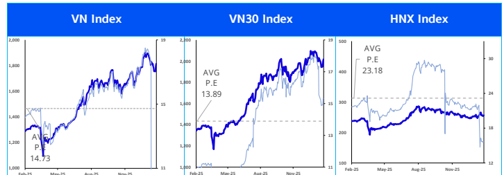
Vietnam Benchmark Index Performance &amp; Multiples (VND bn)

Strategy: Correction sessions present opportunities for investors to increase their positions. We recommend focusing on stocks with good business results and promising growth prospects in 2026 but which have not yet experienced corresponding growth, such as private banking, retail, securities, and steel. Stocks showing positive growth potential, such as state-owned banks and industrial real estate stocks, require selective evaluation and avoiding chasing high prices.