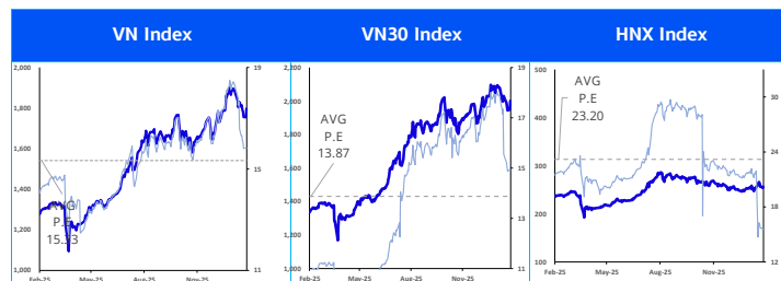
Vietnam Benchmark Index Performance &amp; Multiples (VND bn)

Strategy: Correction sessions present opportunities for investors to increase their positions. We recommend focusing on stocks with good business results and promising growth prospects in 2026 but which have not yet experienced corresponding growth, such as private banking, retail, securities, and steel. Stocks showing positive growth potential, such as state-owned banks and industrial real estate stocks, require selective evaluation and avoiding chasing high prices.