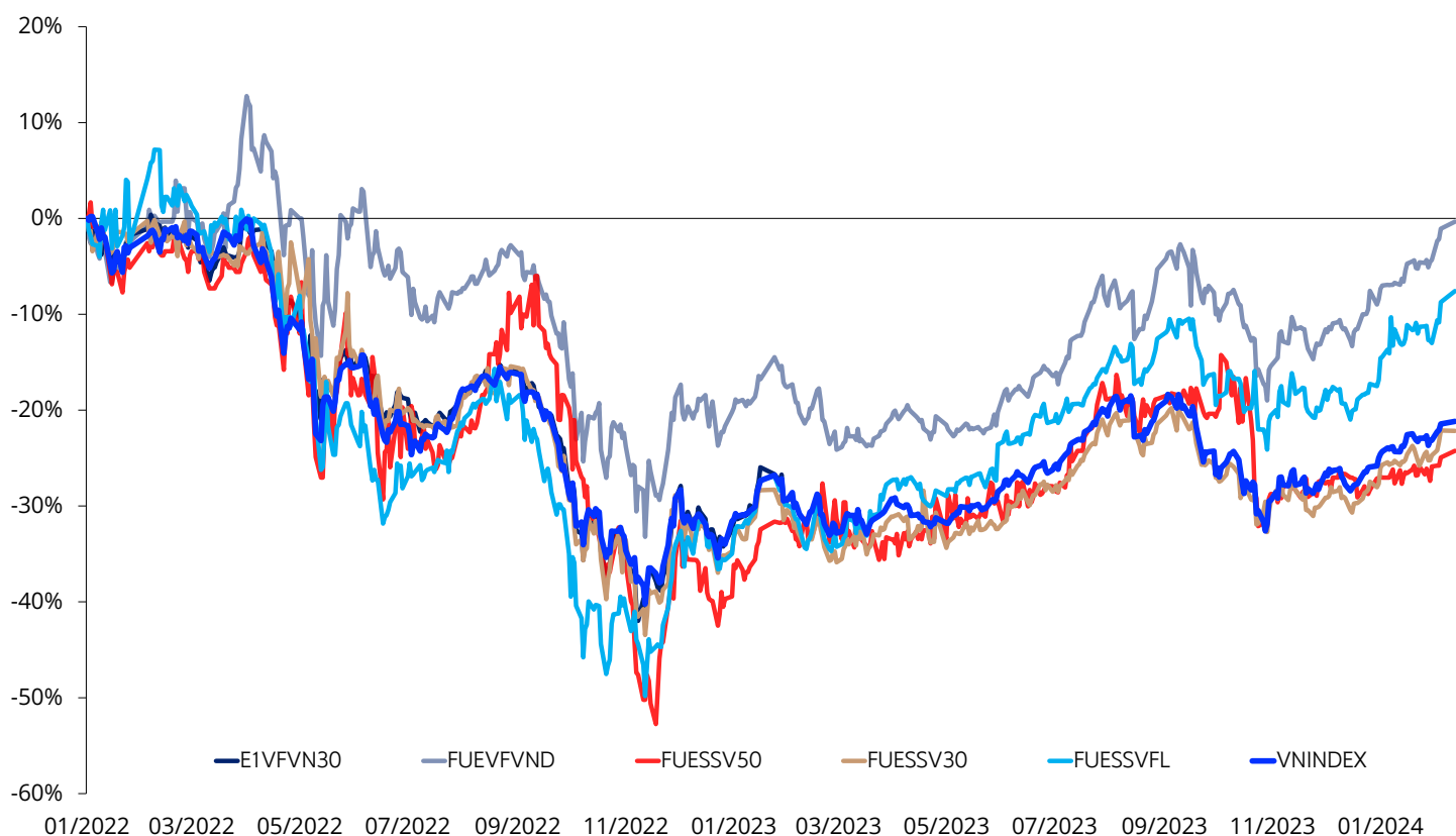
Statistics of domestic ETFs