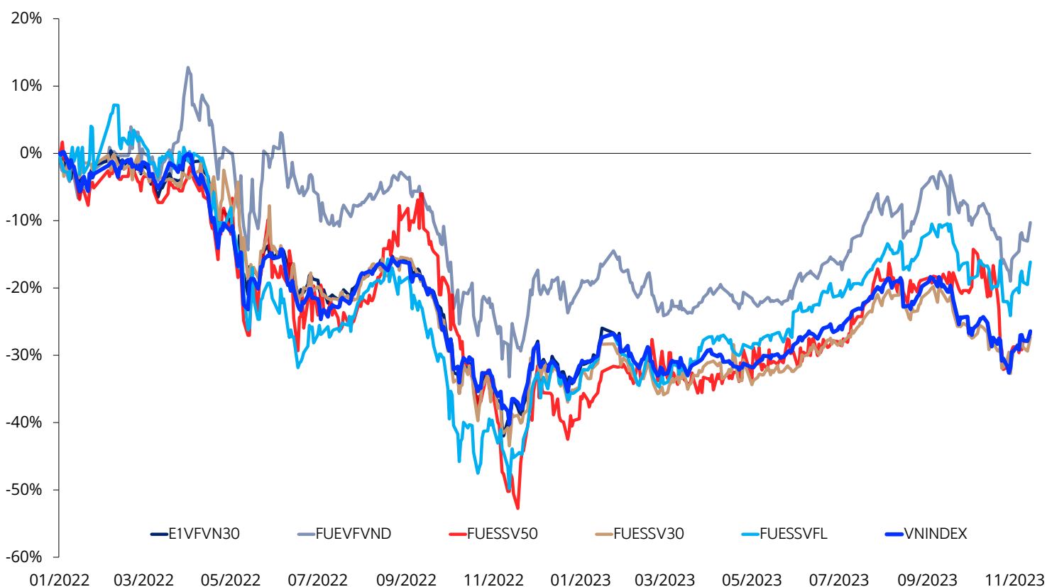
Statistics of domestic ETFs